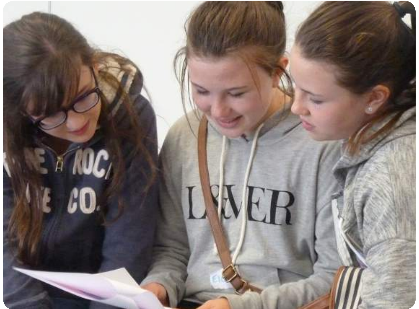
Public contributors generating ideas at a workshop

The ethics of public involvement in research is related to the involvement of patients and the public as participants in research. For more information consult your local Research Design Service or visit www.invo.org.uk . INVOLVE and the Health Research Authority guidance makes clear that you do not need ethical review for public involvement in research.