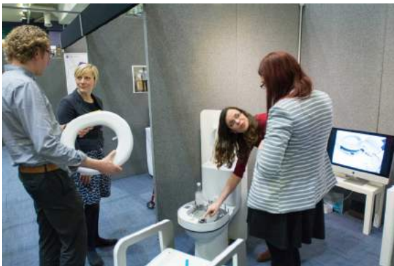
The portable bidet designed by the Design Together Live Better workshops is demonstrated at the West of England Academic Health Science Network annual conference.

"It was great to be able to share my ideas at the workshop... I hope there will be more opportunities to keep contributing like this."